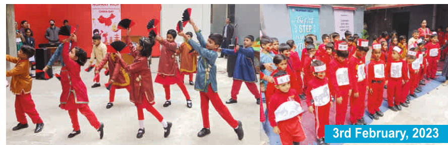
3rd February, 2023