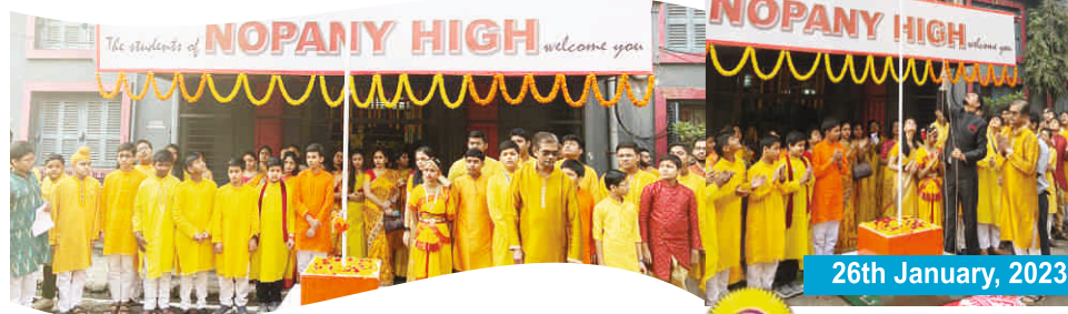
26th January, 2023

On 26th January, 2023, the students of Nopany High Celebrated Republic Day with great enthusiasm and Patriotism. of the Chinese New Year (Rabbit Year).