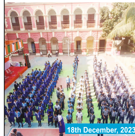
18th December, 2023