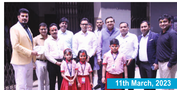
11th March, 2023

Nopany High organized a Basant Milan event on the 11 th of March, 2023, where alumni met with current students, parents and teachers to celebrate the spirit of togetherness. It was a joyous moment for everyone present as they reminisced about their fond memories of the school.