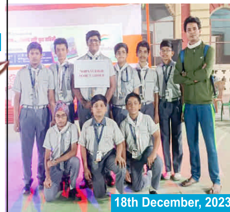
18th December, 2023

The school's focus on experiential learning and personality development has provided an opportunity for students to broaden their horizons beyond the four walls of the classroom.