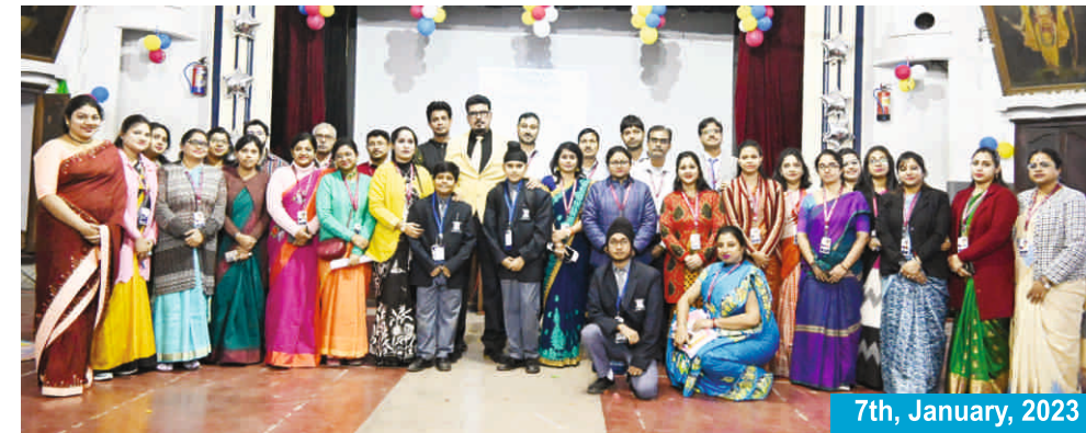
7th, January, 2023

January 7th, Nopany High had set an example again by organizing a free health check-up camp and awareness Program for the children.