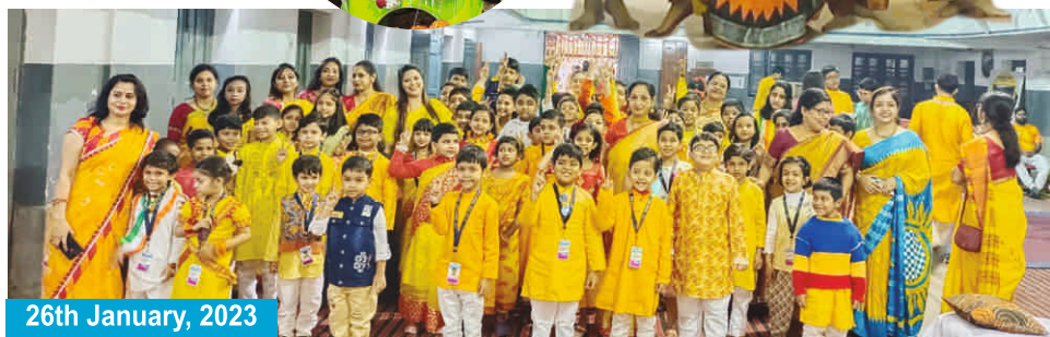
26th January, 2023