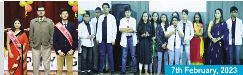
7th February, 2023

A farewell isn't a goodbye but the celebration to begin a new journey. Nopany High organised a farewell function for the ISC 2023 batch to encourage them to come up with flying colours.