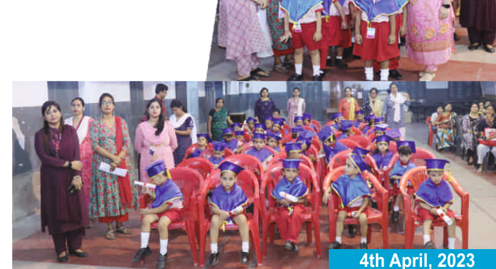
4th April, 2023

A graduation day ceremony was organized on 4 th April for our little pre-primary graduates who have come a long way! Graduation is a time to celebrate an extremely pivotal milestone in people's lives. The milestone in education is something worth commemorating and enjoying. For pre primary's graduation, their day to shine shows the ones they love all they have accomplished throughout the year.