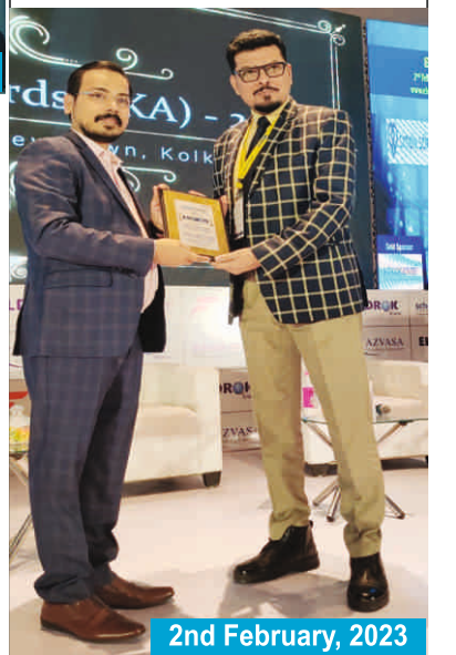
2nd February, 2023

A graduation day ceremony was organized on 4 th April for our little pre-primary graduates who have come a long way! Graduation is a time to celebrate an extremely pivotal milestone in people's lives. The milestone in education is something worth commemorating and enjoying. For pre primary's graduation, their day to shine shows the ones they love all they have accomplished throughout the year.